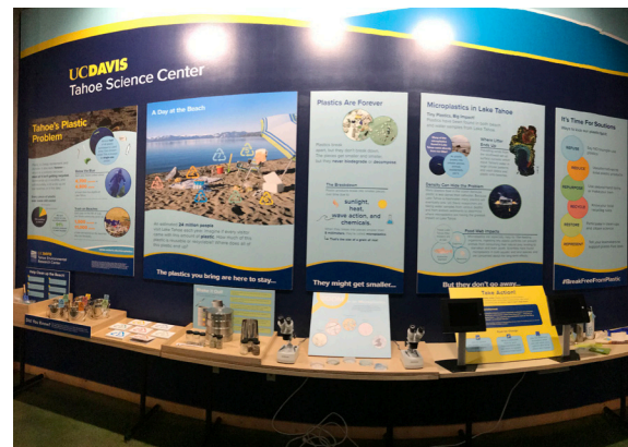
New exhibit on microplastics and plastic pollution includes hands-on activities and interpretive panels (funded by the Nevada Division of Environmental Protection).