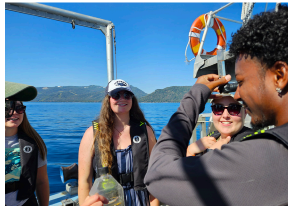
Seven undergraduate interns from a variety of universities come together to learn about science and research. Over the summer, they will learn to be better communicators of science and complete a project that contributes to TERC's overall mission and goals.