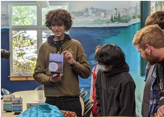
Spanish Springs High School students were eager to check out the scavenger hunt available in the Underwater Lake Tahoe Lounge at the UC Davis Tahoe Science Center™.

As part of the American Alliance of Museums (AAM) Museum Assessment Program TERC is expanding the accessibility of science education to Spanish-speaking visitors and a younger demographic (age eight and younger). Spanish translated speech bubbles will be added to the Tahoe Science Center that express guiding questions through the science center exhibits.