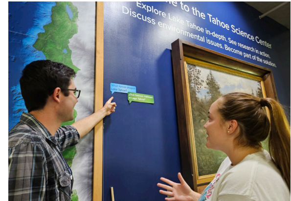
New discussion questions geared towards English and Spanish speakers prompt thought-provoking conversation between visitors and TERC education staff.