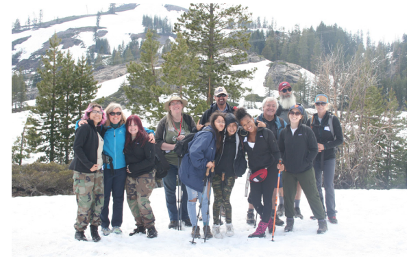
As part of a pilot summer camp program, underserved students from Patterson High School came to the Tahoe Truckee area. For all of the students, this was their very first time visiting the Tahoe area and participating in the science and outdoor activities offered.