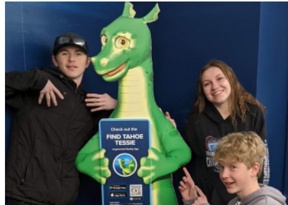
Dayton High School students were so excited to find Tahoe Tessie, they had to capture a photo. Here's hoping this picture wins the Find Tahoe Tessie photo contest!