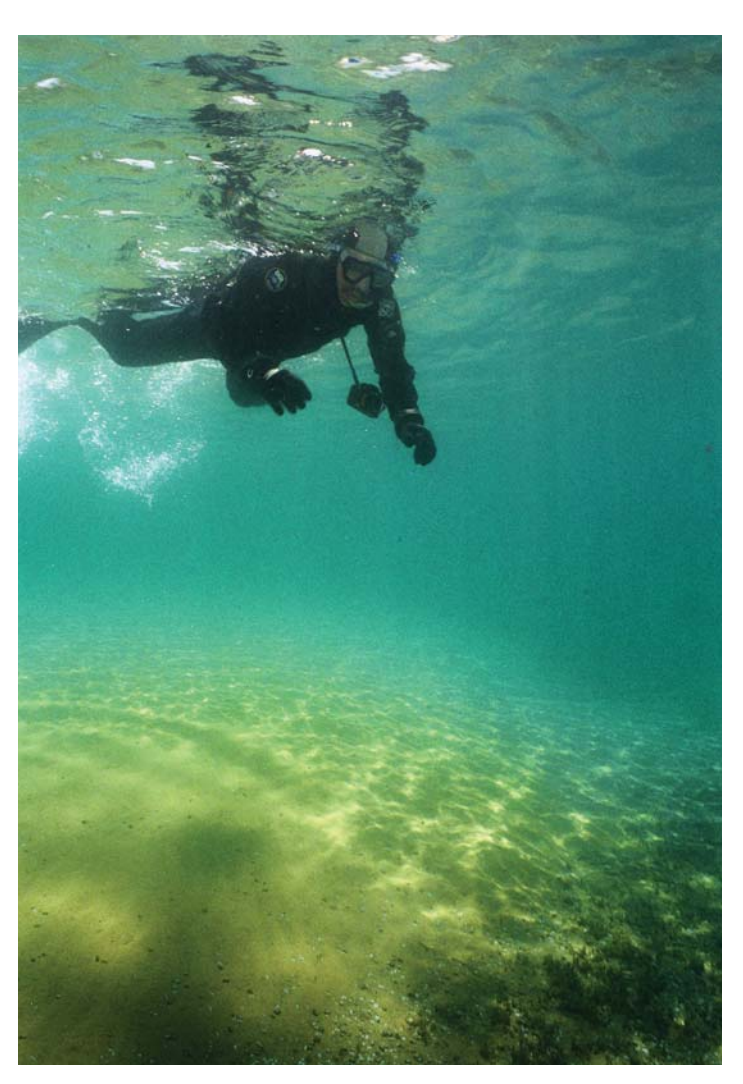
Researchers investigate extensive beds of Asian clams in Lake Tahoe