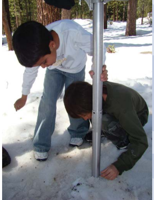
Students remove a snow core to learn about snow

The Science Expo was truly a collaborative effort,