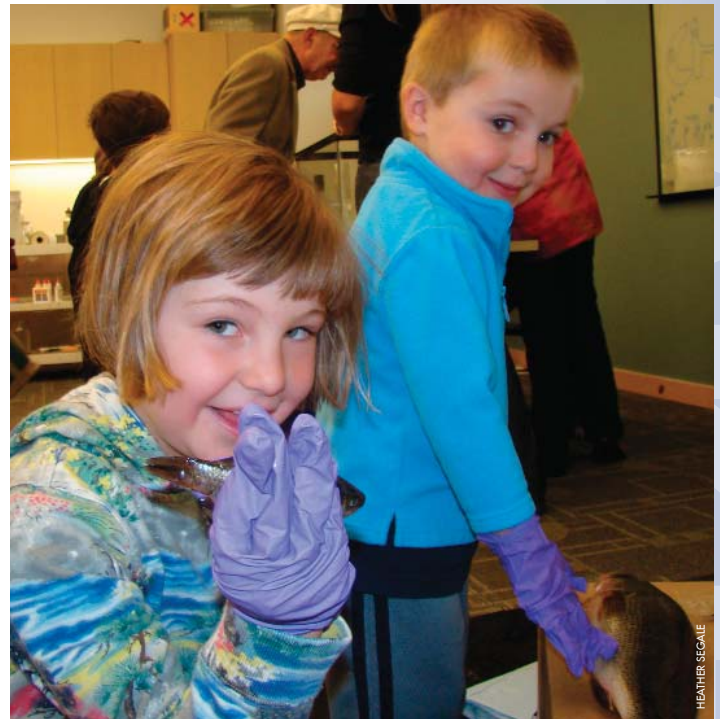
Join us for Children's Environmental Science Day and Eriksson Education Center Opening on July 10, 2010

Children's Environmental Science Day will be held on July 10, 2010, 1 - 4