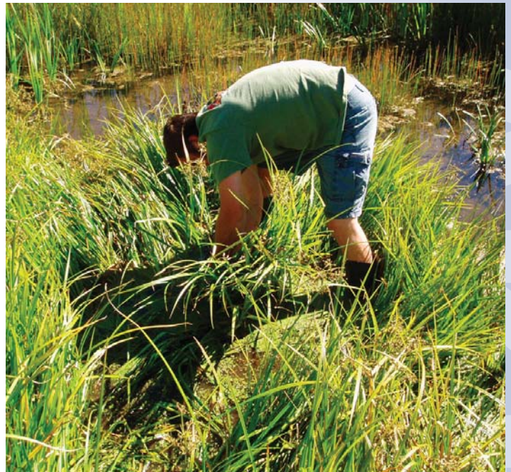
Raph Townsend of the Stormwater Team studies wetland plants

The automated samplers do a fair bit of the work; they continuously log the level of the stormwater flowing through a site at five minute intervals. Automated samplers also collect stormwater samples. Despite the sophistication of the equipment, a good deal of human input is still required. Before it rains, calibration and battery charge need to be checked, and sampling intervals must be programmed based on the predicted duration and intensity of a coming storm. So the stormwater team tracks the weather in a number of ways; when a storm is close they check the weather radar almost constantly. It's not just a single field of science either. "You have to be passionate about a lot of things,"