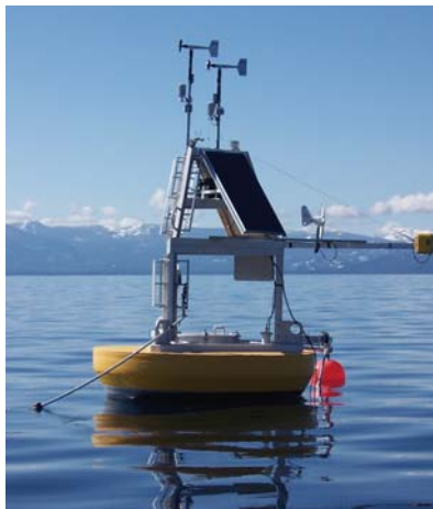
One of six buoys that forms the joint TERC-NASA real-time meteorological and lake temperature network at Lake Tahoe. Each station reports at 15 minute intervals.

R esearchers from the Tahoe Environmental Research Center maintain a network of real-time meteorological and lake temperature stations on the water and on land. Along with collaborators from NASA's Jet Propulsion Laboratory (JPL), TERC has a network of six research buoys and rafts on Lake Tahoe. Serving as research stations, these vessels provide information that ensures Earth-observing satellites are measuring the Earth's surface temperature correctly. Several environmental satellites, including Terra, Landsat, Aqua and Envisat, fly over Lake Tahoe to collect data, with about six satellites passing by each day. The NASA and UC Davis scientists have been collaborating