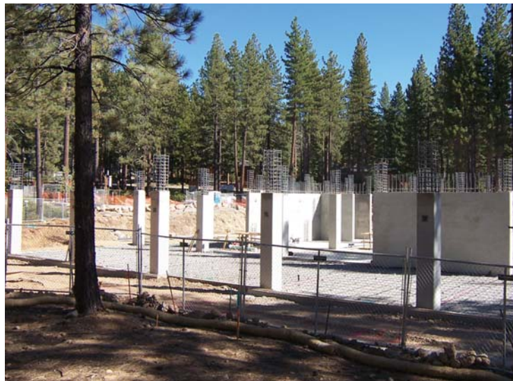
The foundation of the Tahoe Center for Environmental Sciences is complete. For live webcam views visit http://terc.ucdavis.edu .

include energy efficient technology, including nighttime heat storage through specially treated insulation, solar power and the use of natural daylight to reduce the artificial use of energy. Rainwater and snowmelt will be collected and used for irrigation and toilets. Trees felled to clear the site were milled on site and will be used for building trim.