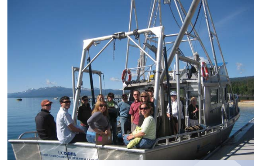
TERC Docents enjoy an educational trip on the TERC Research Vessel John LeConte.

TERC is hoping to grow the docent program and recruit more people for the summer of 2008.