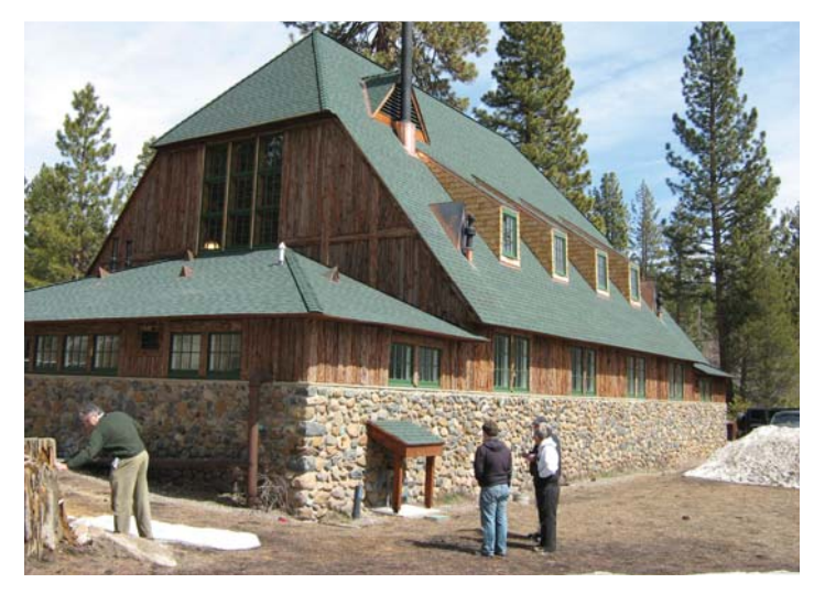
The UC Davis Tahoe City Field Station receives a historic renovation.