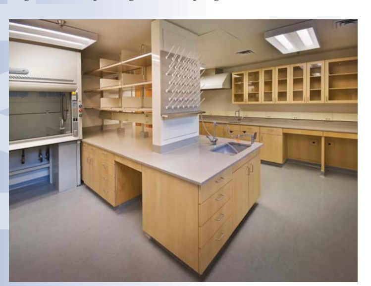
The new prep lab will allow researchers to filter and process samples taken from the lake and West Shore streams within required time limits.

We have other plans for the site as well. Heather Segale, education and outreach coordinator, is coordinating restoration of the surrounding 3-acre degraded wetland and stream environment zone and planning interpretive features and outreach programs that utilize this